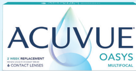
ACUVUE® OASYS MULTIFOCAL