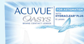
ACUVUE® OASYS for ASTIGMATISM

If HALF of your purchase is ACUVUE® OASYS with HYDRACLEAR® PLUS, you are eligible for this rebate.