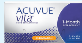
ACUVUE® VITA® for ASTIGMATISM