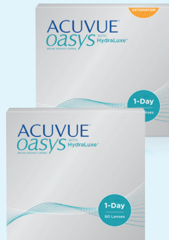
ACUVUE® OASYS 1-Day ACUVUE® OASYS 1-Day for ASTIGMATISM