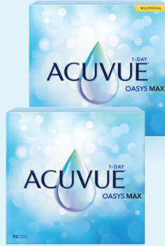
ACUVUE® OASYS MAX 1-Day ACUVUE® OASYS MAX 1-Day MULTIFOCAL