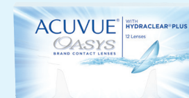
ACUVUE® OASYS with HYDRACLEAR® PLUS

**See reverse for full rebate terms and conditions. Rebate provided on a prepaid card or cheque. ACUVUE® Vita* Prepaid Card is issued by Peoples Trust Company pursuant to license by Visa Int. *Trademark of Visa International Service Association and used under license by Peoples Trust Company. Card can be used everywhere Visa cards are accepted. Virtual ACUVUE® Prepaid Mastercard® is issued by Peoples Trust Company under license from Mastercard International Incorporated. Mastercard and the circles design are registered trademarks of Mastercard International Incorporated. Virtual card can be used online where Mastercard is accepted. Card/virtual card has no cash access and cannot be used for recurring payments. Card/virtual card valid for up to 6 months; unused funds will forfeit after the valid thru date. Terms and conditions apply.