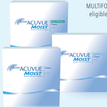
1-DAY ACUVUE® MOIST 1-DAY ACUVUE® MOIST for ASTIGMATISM 1-DAY ACUVUE® MOIST MULTIFOCAL

If HALF of your purchase includes MULTIFOCAL or ASTIGMATISM, you are eligible for the higher value rebate.