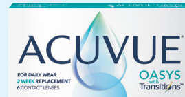
ACUVUE® OASYS with Transitions™